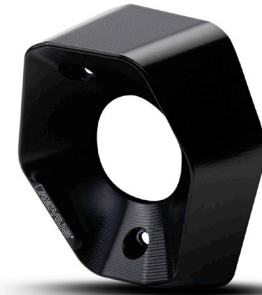
EK112S - endcap black screws included