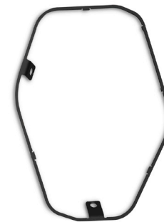
EKR001S - Farbring schwarz