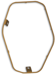
EKR001G- Farbring gold