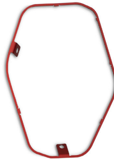
EKR001R - Farbring rot