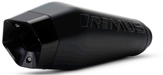
45772 100165 - RS 2.0 Edelstahl schwarz